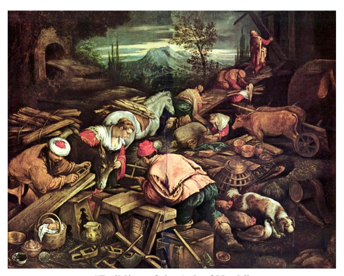
"Building of the Ark of Noah"

Jacopo Bassano (approximately 1518-1592) Metropolitan Museum of Art